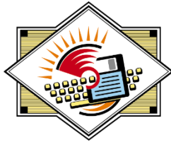
Business, Management Marketing & Technology