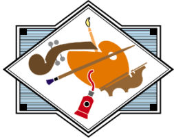
Arts & Communications