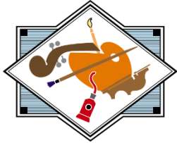
Arts & Communications