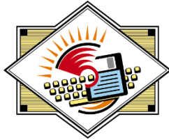
Business, Management Marketing & Technology