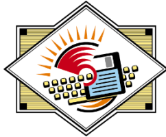
Business, Management Marketing & Technology